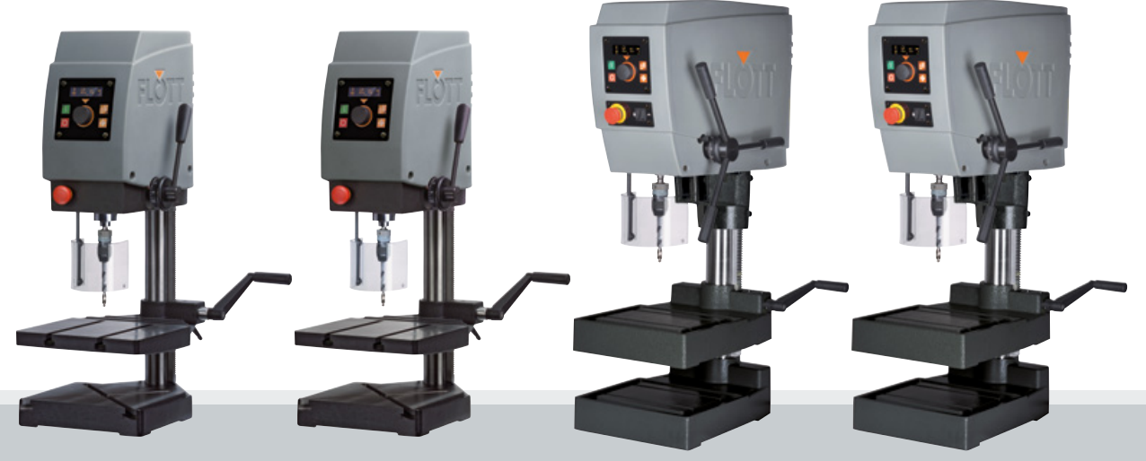
Figure with option

(on request, this can be extended up to 5 years, subject to an additional charge)