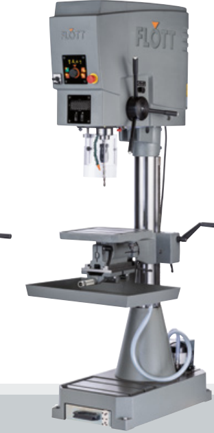
Figure with option

3-year warranty for single-shift operation (on request, this can be extended up to 5 years, subject to an additional charge)